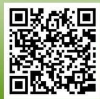
Donate To Us